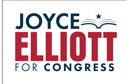
Inverted The original, but with a twist