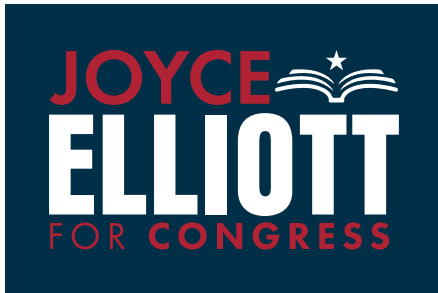
Red-White Optimized to use on blue. Note the book in all white.