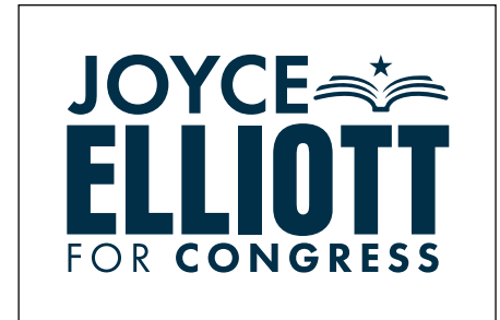
Solid Color When all else fails. Use on light backgrounds.

You can find these logos and more in the attached folder. Simplified versions can be found there as well.