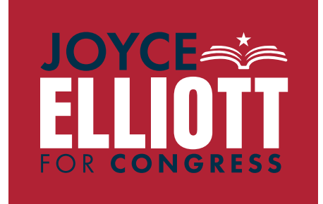
Blue-White Optimized to use on red. Note the book in all white.