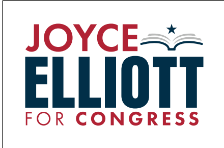
Original Do I need to say anymore?

In order to contrast on different backgrounds different versions of the logo may be implemented in such situations. Use your best judgement to gauge how legible the logo is on different colors. You can always ask for a second opinion.